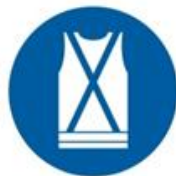
HI VIS CLOTHING